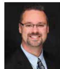
State Award for Exemplary Contribution to Service to Athletics