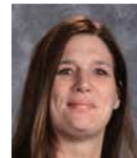
HS Teacher of the Year